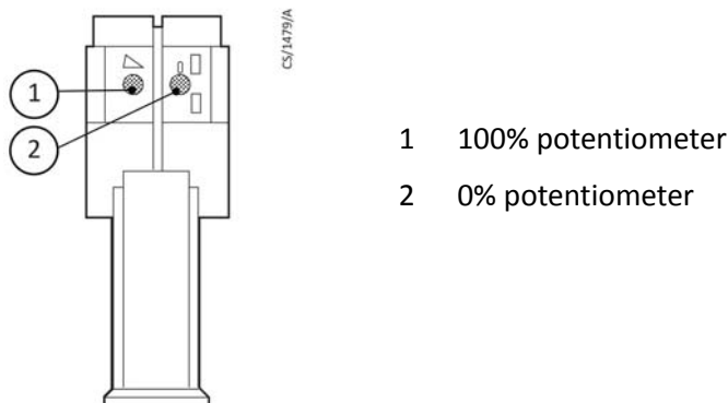
Figure 2 Gauge head PRG20K - NW16 Al / PRG20K - DN16CF SS / PRG20KCR - NW16 SS