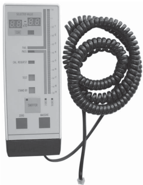
Fig. 3: Special sniffing remote control

The special sniffing remote control for sniffing leak detectors must be used only with the ASM 102 S and ASM 142 S.